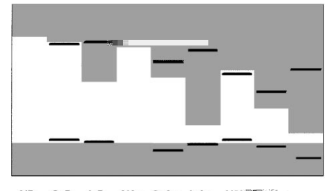
AIR GaP INP AIAs GaAs InAs AISb